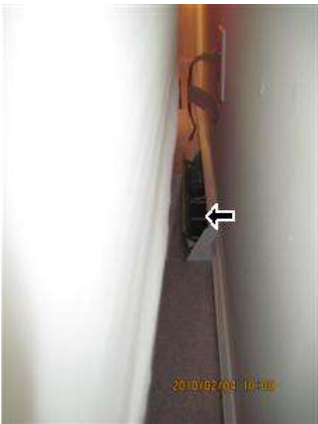
14.5 Picture 1

14.5 DUCT CLEANING IS RECOMMENDED. REMOVE HUMIDIFIER. INSTALL ALL MISSING DUCT REGISTERS.