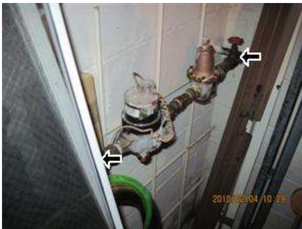
12.1 Picture 1

TOO MANY DEVICES NEEDED TO SHUT DOWN SYSTEM. HAVE A LICENSED ELECTRICIAN REWIRE/REPLACE PANEL TO ALLOW NO MORE THAN 6 DEVICES FOR COMPLETE SYSTEM SHUT-DOWN.