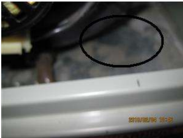
14.0 Picture 1

EVIDENCE OF CONDENSATE LEAKAGE NOTED IN HIGH-EFFICIENCY FURNACE.