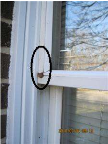
2.3 Picture 1