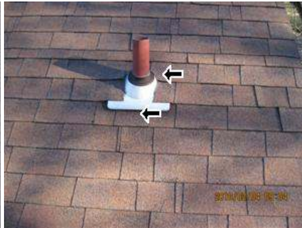
1.3 Picture 2