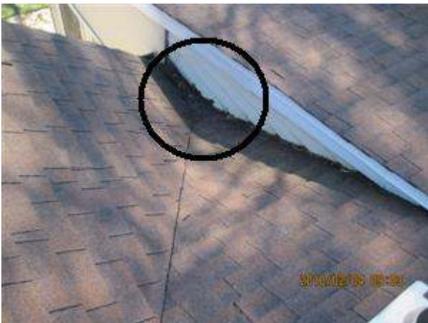
1.0 Picture 1