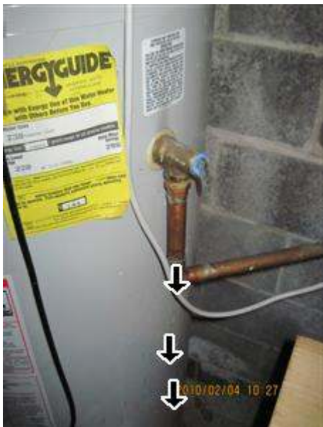
13.5 Picture 1

13.5 PIPE RELIEF VALVE WITHIN 6" OF FLOOR. PLAN FOR AGE-RELATED REPLACEMENT.