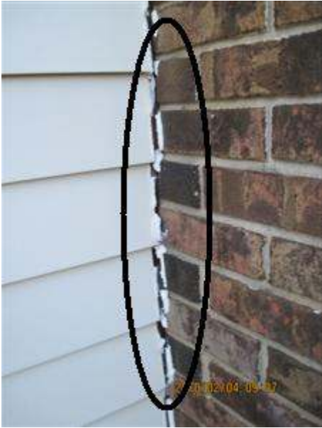
2.0 Picture 2