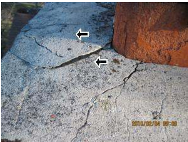
1.4 Picture 1

REVIEW FOLDER- ROOFING/EXTERIOR ELEMENTS (PAGE 5)- FOR GENERAL INFORMATION AND PERTINENT COMMENTS ON THE FOLLOWING ITEMS: FLASHINGS ( PAGE 6)