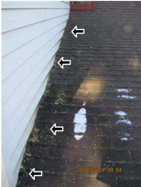
1.3 Picture 1