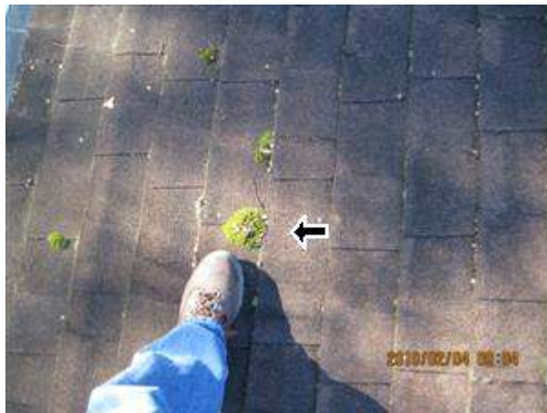
1.0 Picture 2

1.1 CLEAN BLOCKED GUTTER(S) AND SPOUT(S) PERIODICALLY.