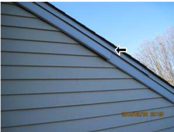
2.1 Picture 1

RESET ALL LOOSE CAPPING NOTED: UPPER LEFT SIDE.