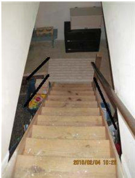
10.3 Picture 1

10.3 ADD GUARD RAILING(S) AT OPEN SIDE(S) FOR SAFETY.