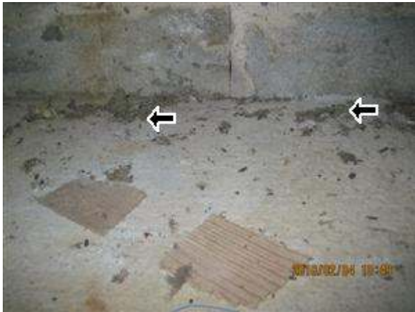
11.1 Picture 1

CONTACT SPECIALISTS FOR FURTHER EVALUATION AND TREATMENT AS NEEDED