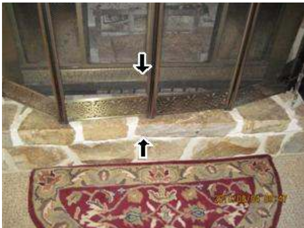
5.7 Picture 1

SHALLOW HEARTH NOTED. EXTEND HEARTH OR USE FIRE-RETARDANT HEARTH MAT TO PROTECT FLOOR.