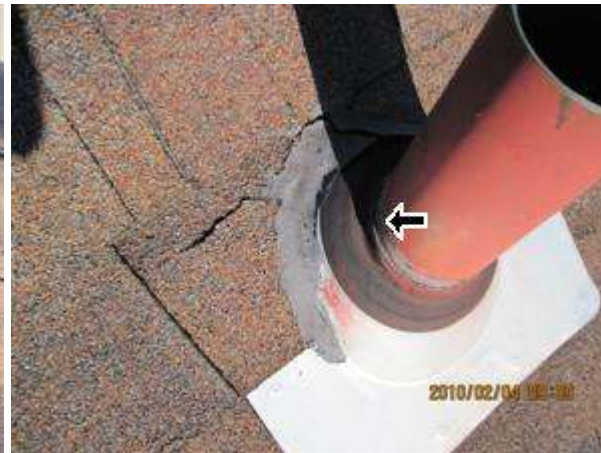
1.3 Picture 4