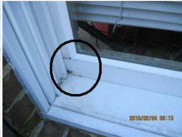
2.3 Picture 2