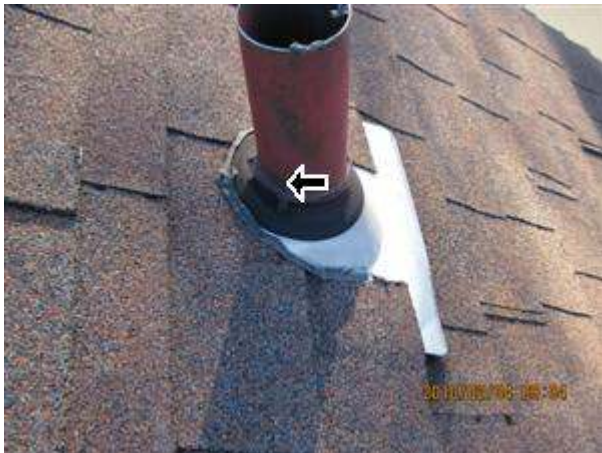
1.3 Picture 3